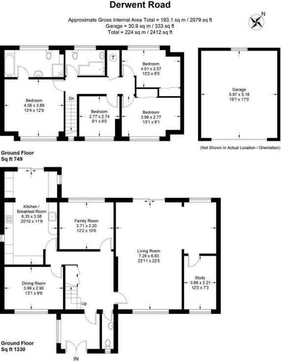
Illustration for identification purposes only, measurements are approximate, not to scale. FloorplansUsketch.com © 2021 (ID767651)

These particulars are intended as a guide and act as information only. They give a fair overall description for the guidance of potential purchasers, but do not constitute an offer or part of a contract. All details and approximate measurements are given in good faith and are believed to be correct at the time of printing